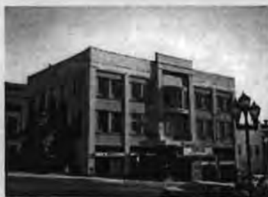
Elks Building and Theater; 1906 and Today

Since its completion in 1905, the Elks Building has been a positive contribution to the community of Prescott. As a commercial structure, the building has complemented the adjacent commercial district; architecturally, it stands as a forerunner of 20th century commercial styles; and socially, the structure has provided a setting for one of the town's most active fraternal organizations. Yet it is principally for its theater that the Elks Building is recognized to be of historic value. Through the first quarter of this century the theater was used for a wide variety of events: minstrel shows, balls, high school plays, graduation ceremonies and serious theater. As movies became popular, they were also presented. The structure is in good condition and, although some remodeling has occurred both to the interior and the exterior, the original integrity of the design is intact and could be recovered.