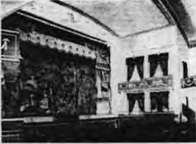
Original Theater Interior

The Elks Building and Theater is a three-story masonry structure of symmetrical massing. Measuring about 95 feet in width by 125 feet in depth, the floor plan is divided into two sections of approximately equal volume. The front portion is divided into rental spaces of various sizes; the rear portion is a theater. On the exterior, few eclectic features were employed. Instead, paired windows and colossal-order pilasters were juxtaposed to create a stark, structural effect. Banks of contrasting masonry above and below the windows accentuate the horizontal thrust.