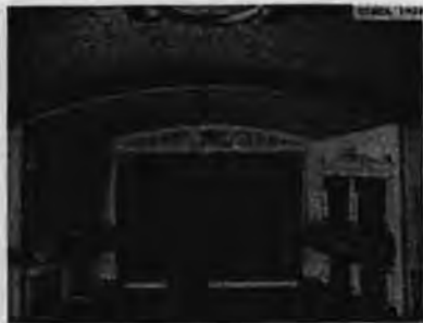
Original Theater Stage

Since the first decade of the twentieth century, the Elks Building and Theater have been central to the daily life and history of Prescott. Its location is close to many other important business and entertainment uses and the building remains an important part of the town's professional and cultural life. Zoning is compatible, although the Business "B" classification allows several uses that would be incompatible within or adjacent to the Elks Building (for a fuller discussion of these incompatible uses, see the section on the Courthouse Plaza National Register District).